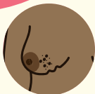
Puckering or dimpling